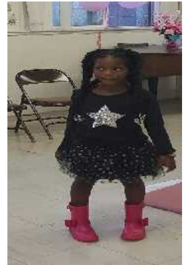
Royal Handmaiden Kenya